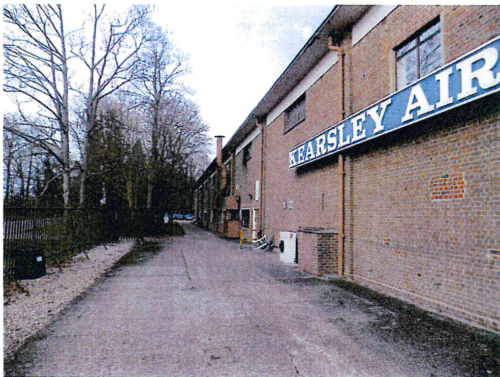
West Facing Elevation