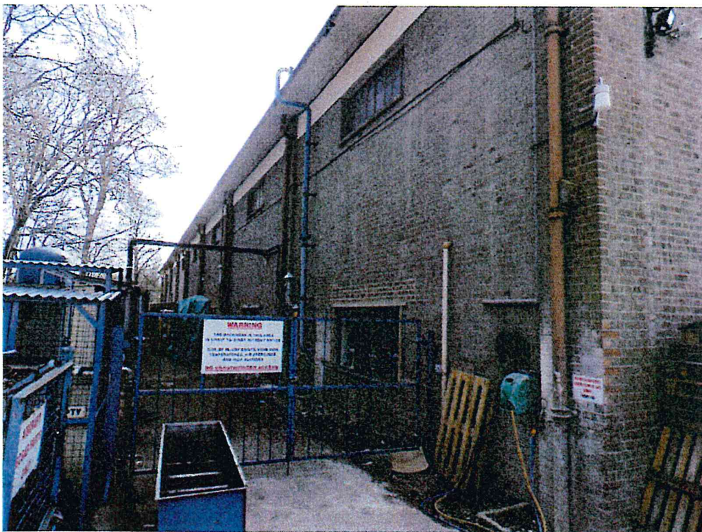
East Facing Elevation